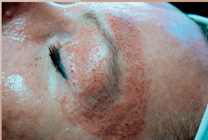
45+ Woman treated lid and brow.

The Subnovii plasma pen will cause microtrauma to the skin, making tiny wounds that stimulate the body's collagen production. Thus, small scabs will form after treatment, which tends to disappear within about 5-10 days. You may experience some itchiness and tightness in the skin as well.