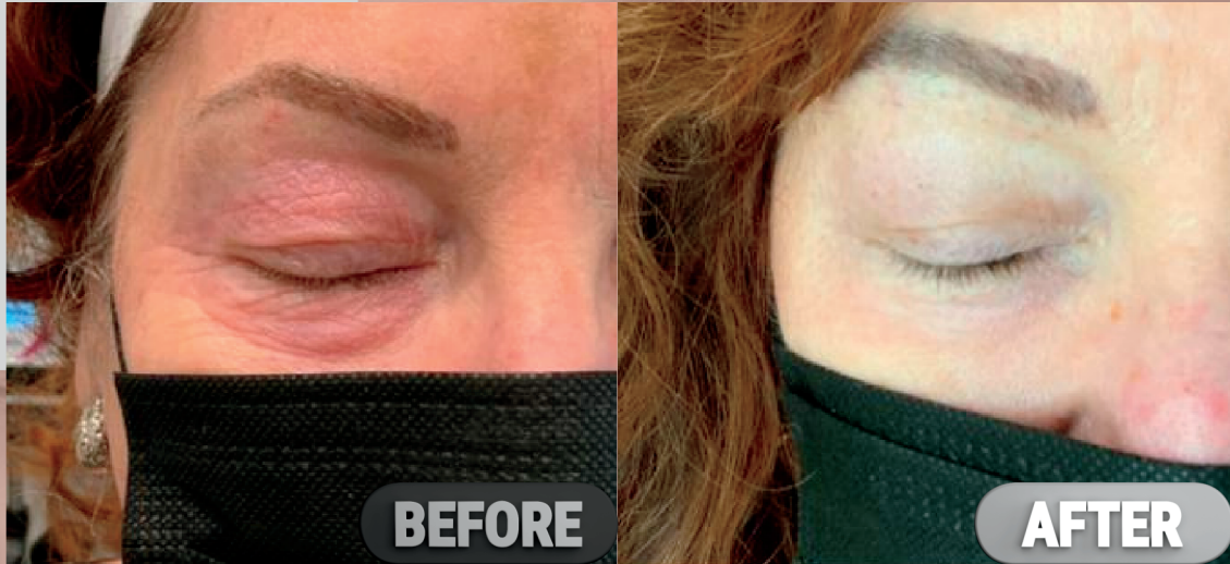
65+ Woman treated eye bags. Results are 1 month post op

Subnovii offers less post- treatment pain, risk of infection and downtime compared to traditional ablative treatments and the results are extremely impressive.