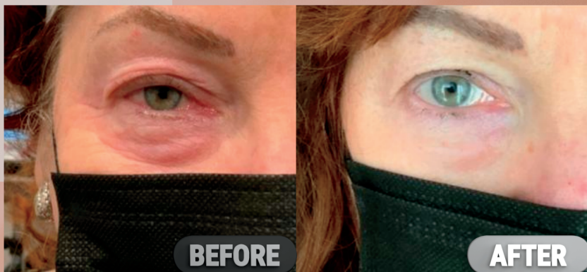
65+ Woman treated eye bags. Results are 1 month post op